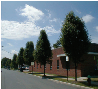
Chanticleer Pear Trees on Pear Street

The Shade Tree Advisory Committee is developing a Memorial Tree Program for Lawrence Township. A living tree memorial is one of the most beautiful and lasting means to remember a person. A young tree being planted to remember someone may last for generations. Planting a memorial tree recalls the life of your loved one and at the same time benefits the environment for years. Planting a tree in a park is a wonderful way to honor a loved one.