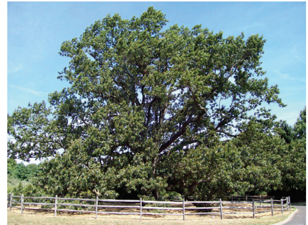
Brearley Oak on Princeton Pike