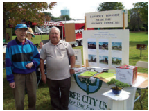
Shade Tree Advisory Committee at Lawrence Township Community Day

Trees help clean the air by filtering particulates as well as pollutants such as ozone, carbon monoxide, and sulfur dioxide. Each tree can absorb 13 pounds of carbon dioxide from the air per year. Trees produce enough oxygen on one acre to sustain 18 people every day.