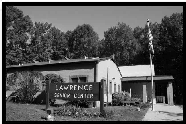
Lawrence Township Senior Center 30 Darrah Lane East

The Lawrence Senior Center is open to Lawrence Township residents 60 years of age and older. The Senior Center offers a wide range of social, recreational and educational activities as well as a library/lounge where seniors are welcomed to relax, socialize, watch television, play board games or read. Perhaps you will consider participating in the excursions they offer. A nutritious lunch is served by the Mercer County Nutrition Project on Mondays, Wednesdays, Thursdays and Fridays. The Lawrence Township Office on Aging publishes a monthly "Lawrence Senior Activities and Events Calendar" to keep seniors updated on the programs being offered at the Senior Center. The Lawrence Senior Citizen van is available to provide transportation for Lawrence seniors Monday through Friday. Call the Office on Aging at (609) 844-7048 for more information, transport assistance guidelines and to schedule appointments. The Senior Center is open Monday through Friday from 8:30 a.m. to 4:30 p.m., excluding holidays.