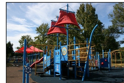
Captain Lawrence Playground Central Park

Armory Fields Twin Pines- Steven J. Groeger Fields Mooch Myernick Training Facility at Village Park Zimmer Field in Central Park