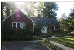
Lawrence Nature Center 481 Drexel Ave, Lawrence, NJ