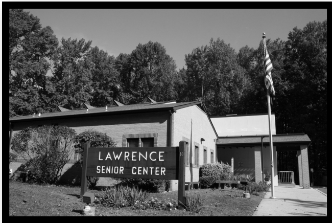
Lawrence Township Senior Center 30 Darrah Lane East

The Lawrence Senior Center is open to Lawrence Township residents 60 years of age and older. The Senior Center offers a wide range of social, recreational and educational activities as well as a library/lounge where seniors are welcomed to relax, socialize, watch television, play board games or read. Perhaps you will consider participating in the excursions they offer. A nutritious lunch is served by the Mercer County Nutrition Project on Mondays, Wednesdays, Thursdays and Fridays. The Lawrence Township Office on Aging publishes a monthly "Lawrence Senior Activities and Events Calendar" to keep seniors updated on the programs being offered at the Senior Center. The Lawrence Senior Citizen van is available to provide transportation for Lawrence seniors Monday through Friday. Call the Office on Aging at (609) 844-7048 for more information, transport assistance guidelines and to schedule appointments. The Senior Center is open Monday through Friday from 8:30 a.m. to 4:30 p.m., excluding holidays.