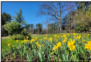
Lawrence Nature Center 481 Drexel Ave, Lawrence, NJ