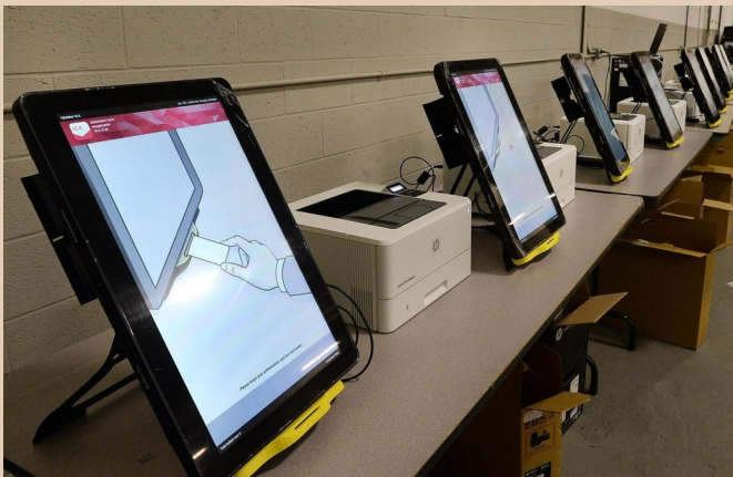
Pictured: Dominion Imagecast Ballot Marking Device

All of these innovations will be in place for the Fall, 2021 November General Election. My office, and the other two election offices in Mercer County, have been working very hard throughout the summer to make sure that all of the new voting equipment is ready to go this Fall. We want to ensure that all voters can have confidence in voting Mercer County, without fear of foreign interference, and we want it to be easy and seamless for everyone. (Continued on page 2)