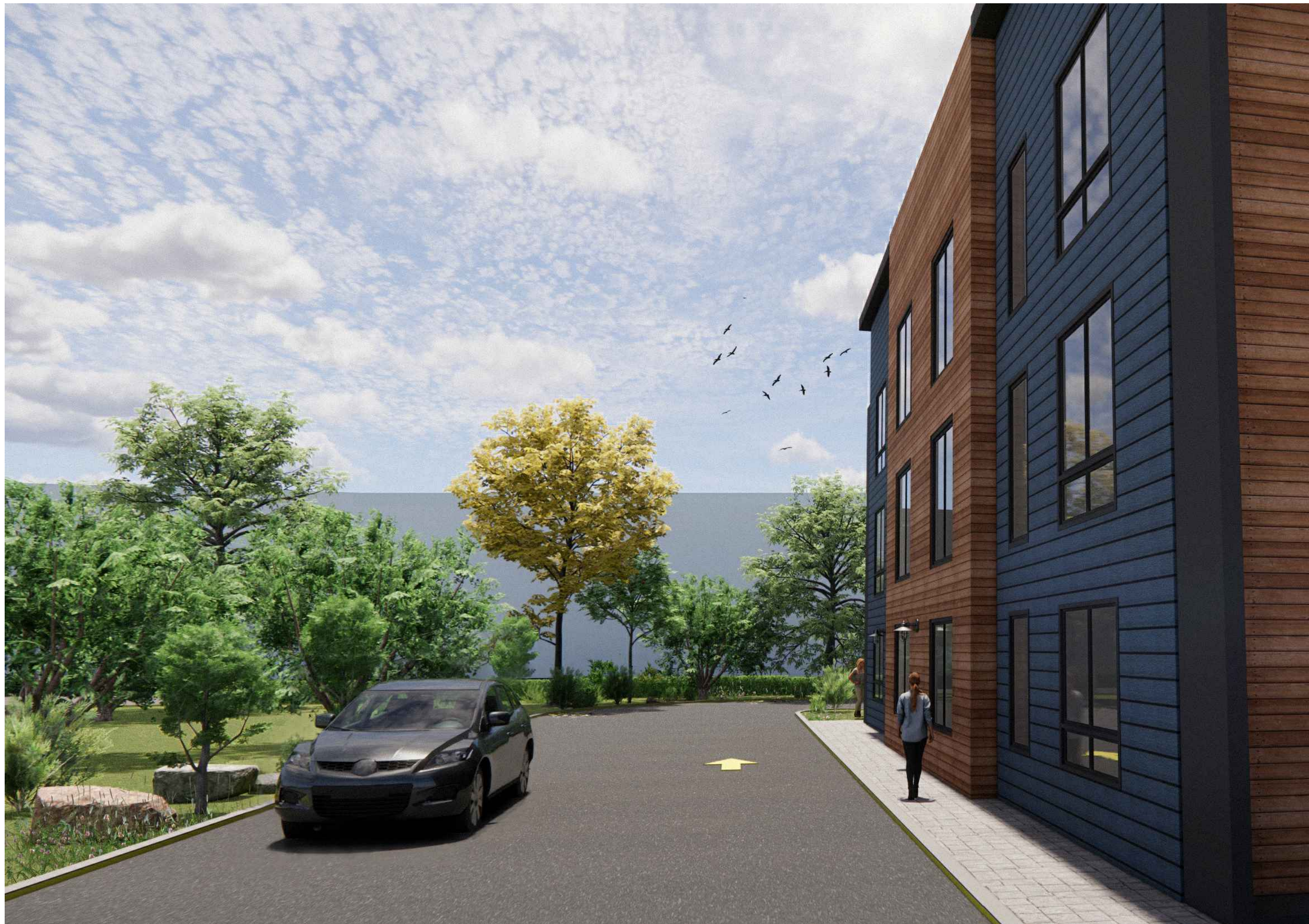
1 EXTERIOR VIEW - LOOKING SOUTH DOWN DRIVE AISLE TOWARDS REAR OF SHOPPING CENTER (MATURE PLANT GROWTH) SCALE: N.T.S.