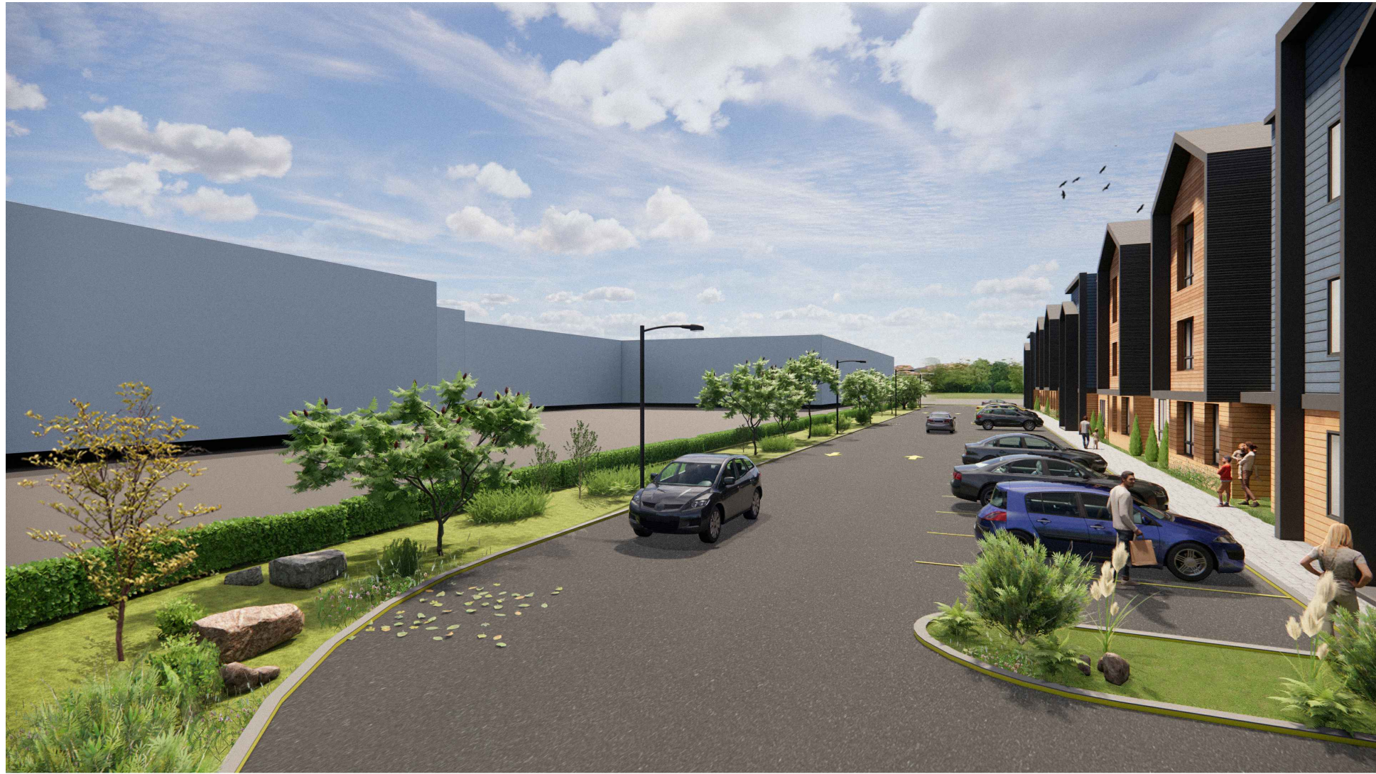
3 EXTERIOR VIEW - LOOKING WEST DOWN NEW DRIVE AISLE/PARKING BETWEEN DEVELOPMENT AND SHOPPING CENTER (INITIAL PLANTING) SCALE: N.T.S.