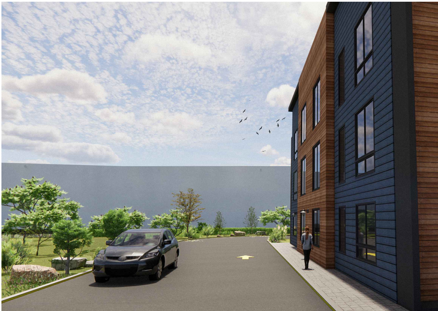
2 EXTERIOR VIEW - LOOKING SOUTH DOWN DRIVE AISLE TOWARDS REAR OF SHOPPING CENTER (INITIAL PLANTING) SCALE: N.T.S.