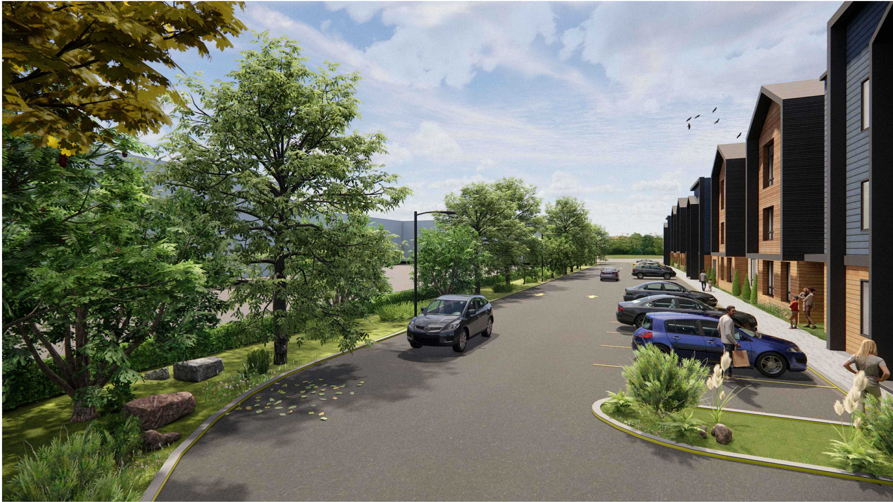
4 EXTERIOR VIEW - LOOKING WEST DOWN NEW DRIVE AISLE/PARKING BETWEEN DEVELOPMENT AND SHOPPING CENTER (MATURE PLANT GROWTH) SCALE: N.T.S.