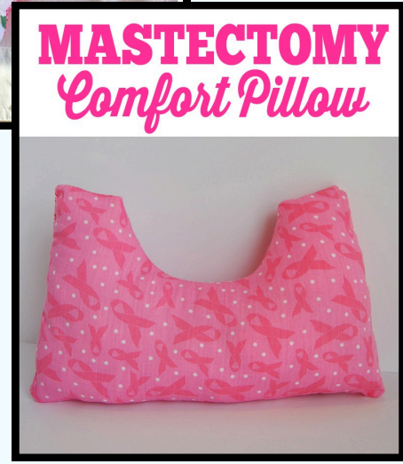
MASTECTOMY Comfort Pillow

If you are interested in helping, we will be meeting Wednesdays at 2:00 PM in our Art room. 609-844-7048