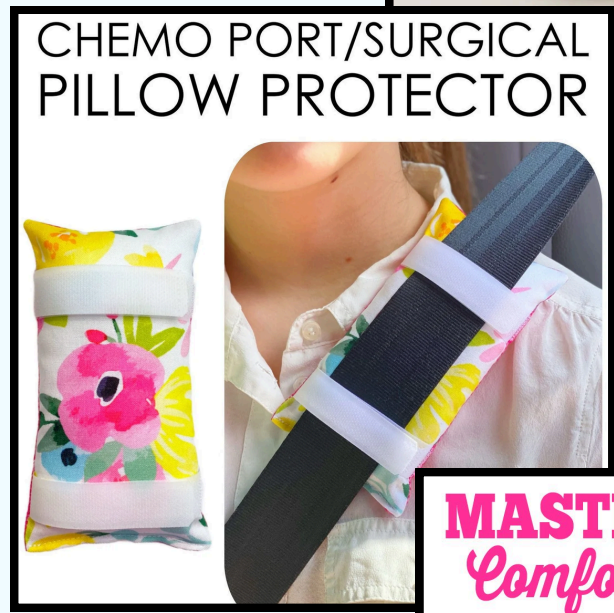
CHEMO PORT/SURGICAL PILLOW PROTECTOR

Sewing pillows for cancer patients is a wonderful way to provide comfort and protection. The two most common and highly requested pillows are chemo port seatbelt pillows (which protect sensitive chest ports) and heart-shaped mastectomy pillows (which provide underarm and chest support after breast surgery). We at the Lawrence Senior Center are looking for volunteers to help CREATE or stuff these projects so we can DONATE them to hospitals or people in need.